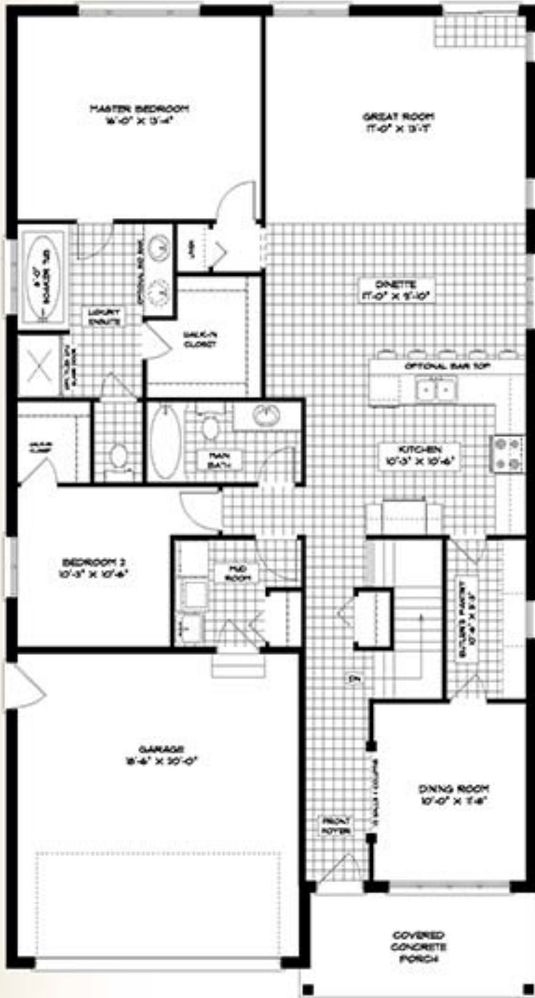
MAIN FLOOR PLAN A