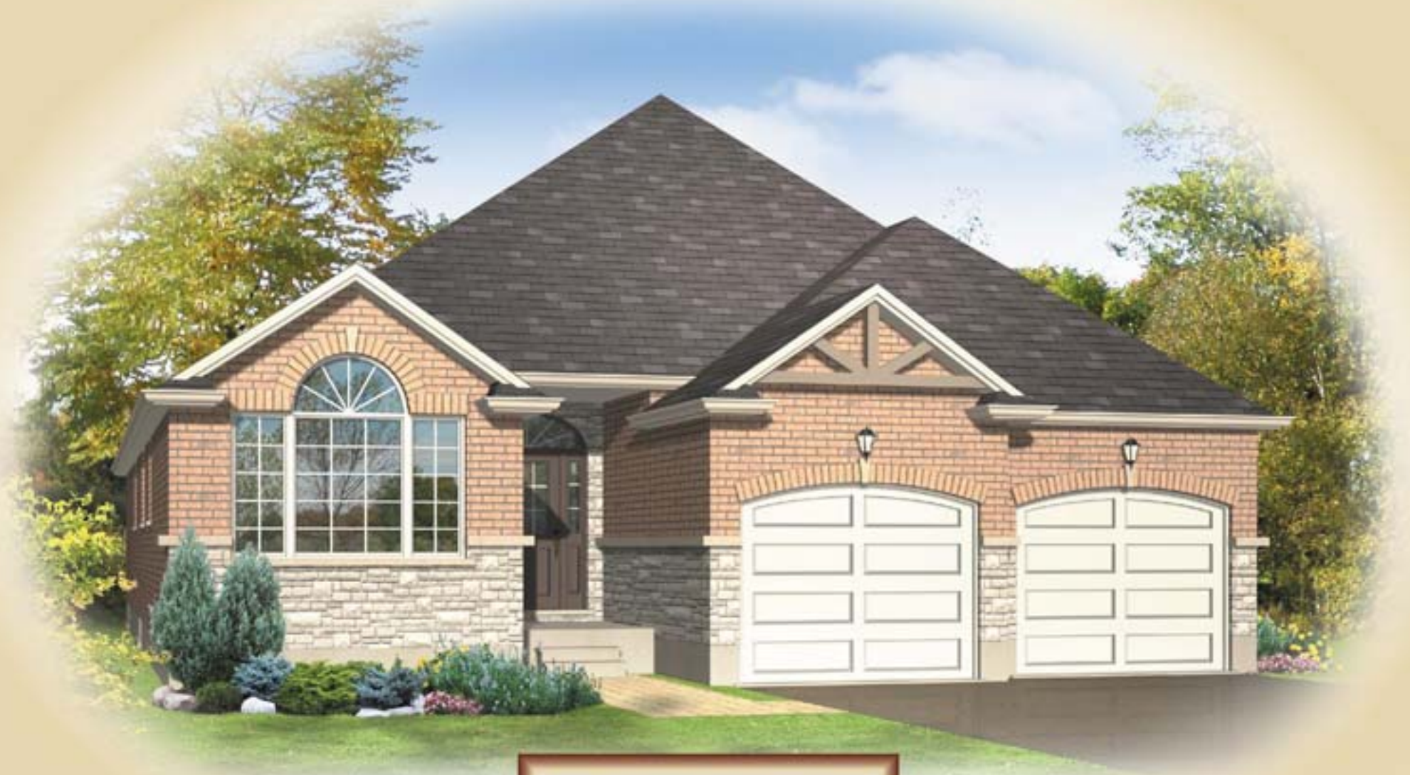
THE AYRSHIRE 1655 SQ. FT.